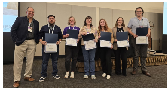
P-IE travel award winners from the 2024 meeting